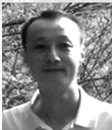
李鵬 Li Peng